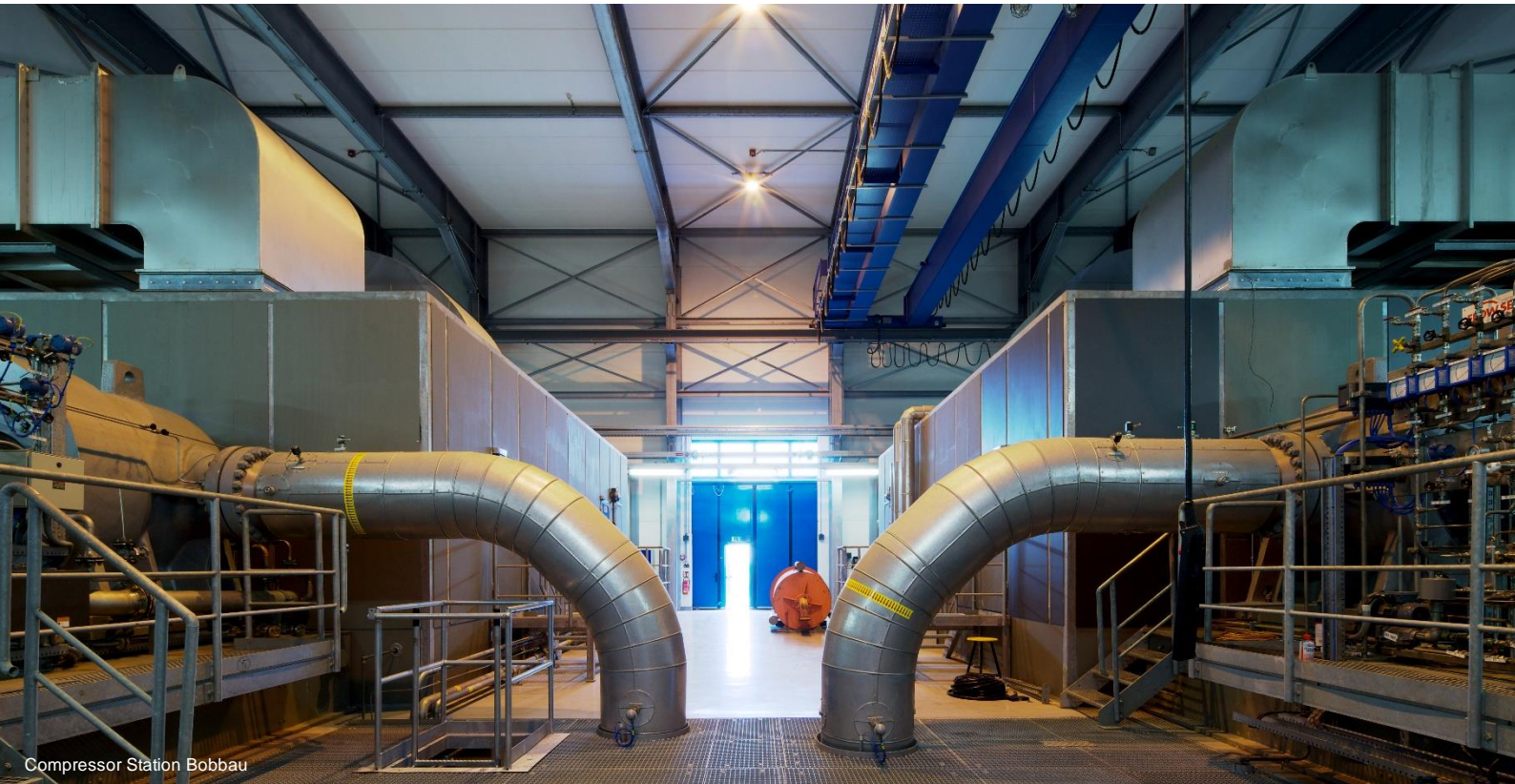
Compressor Station Bobbau