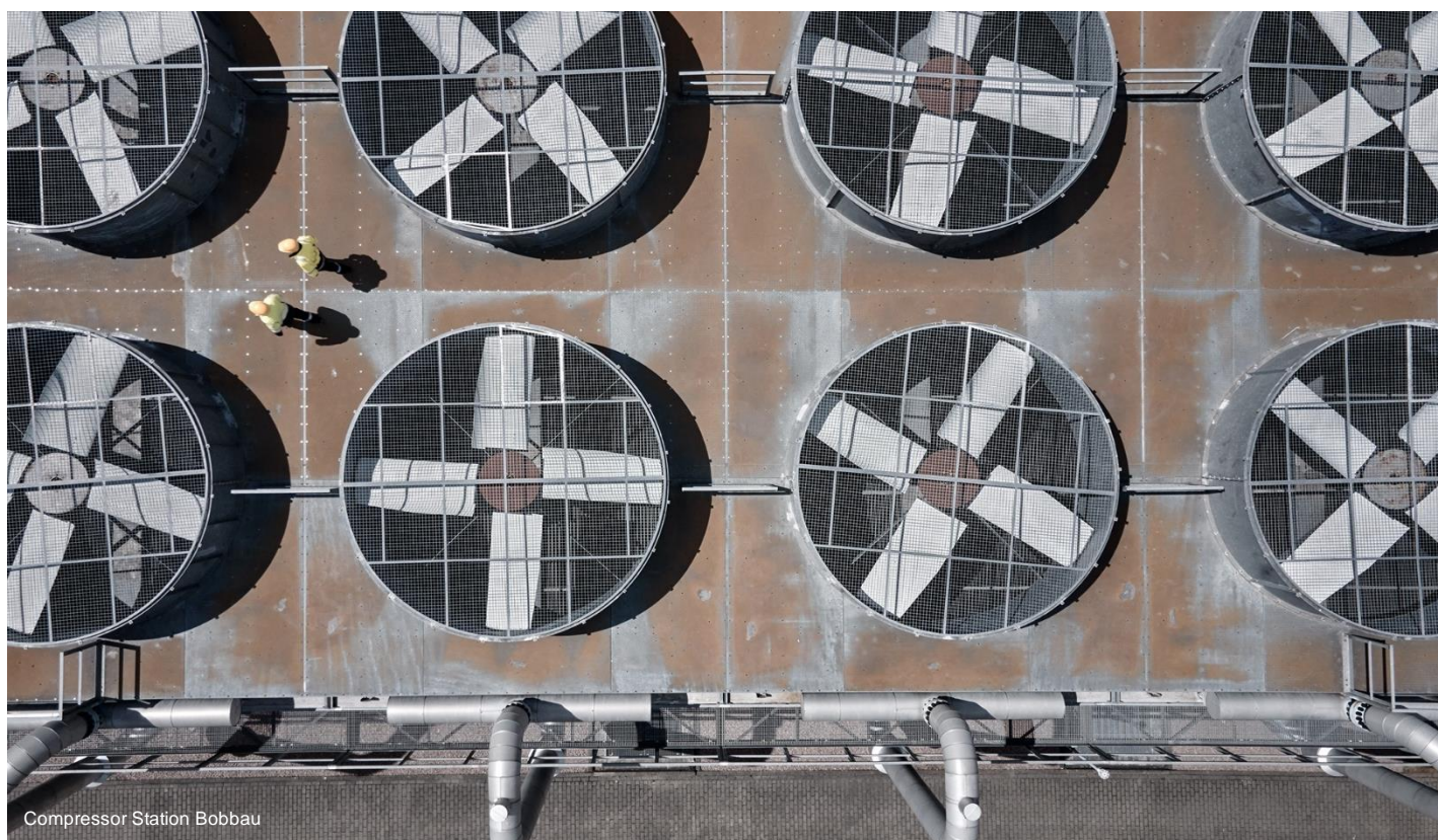
Compressor Station Bobbau